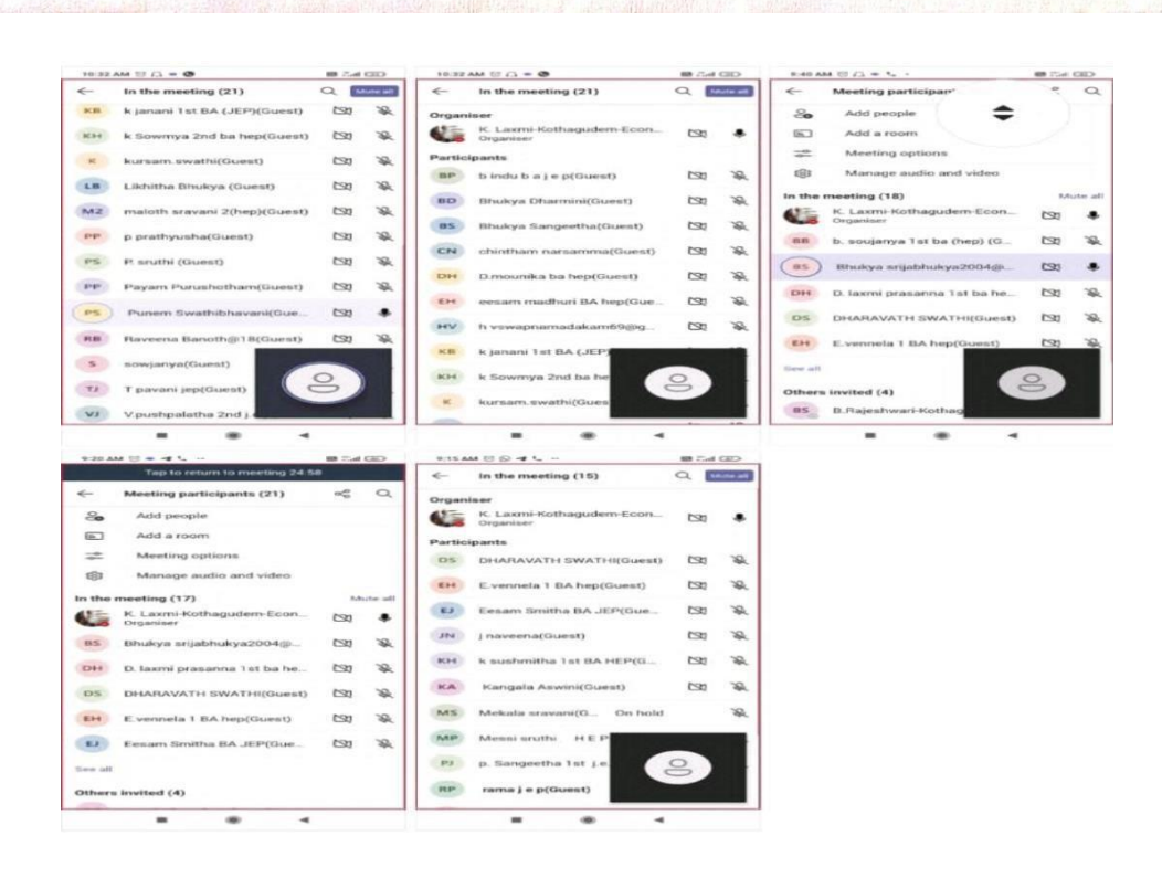
STUDENTS ATTENDACE REPORT

T.W.R. Degree College(Girls) Kothagudem 507 101 Bhadrach Kothagudem Dist